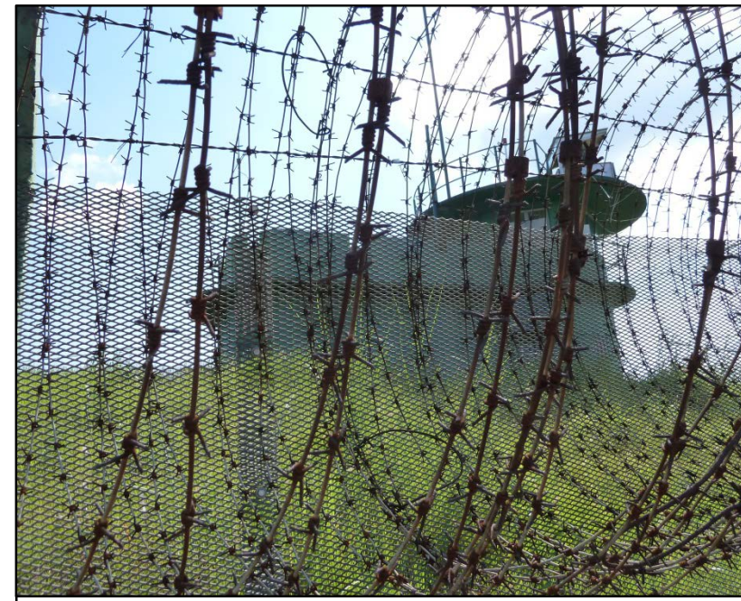
LR10 MacIntosh Fort