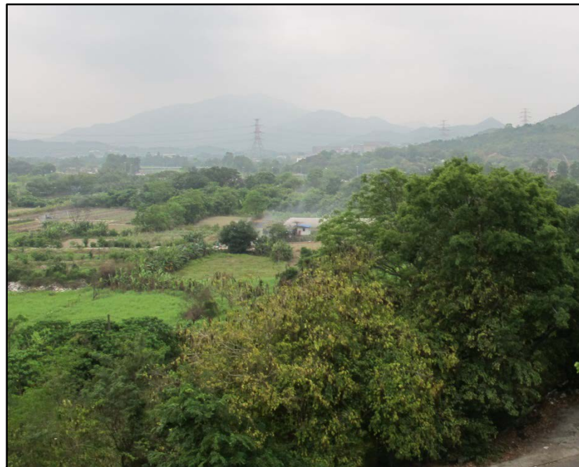
LR8 Lowland Woodland